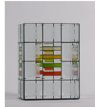
candle holder " cuboid window "