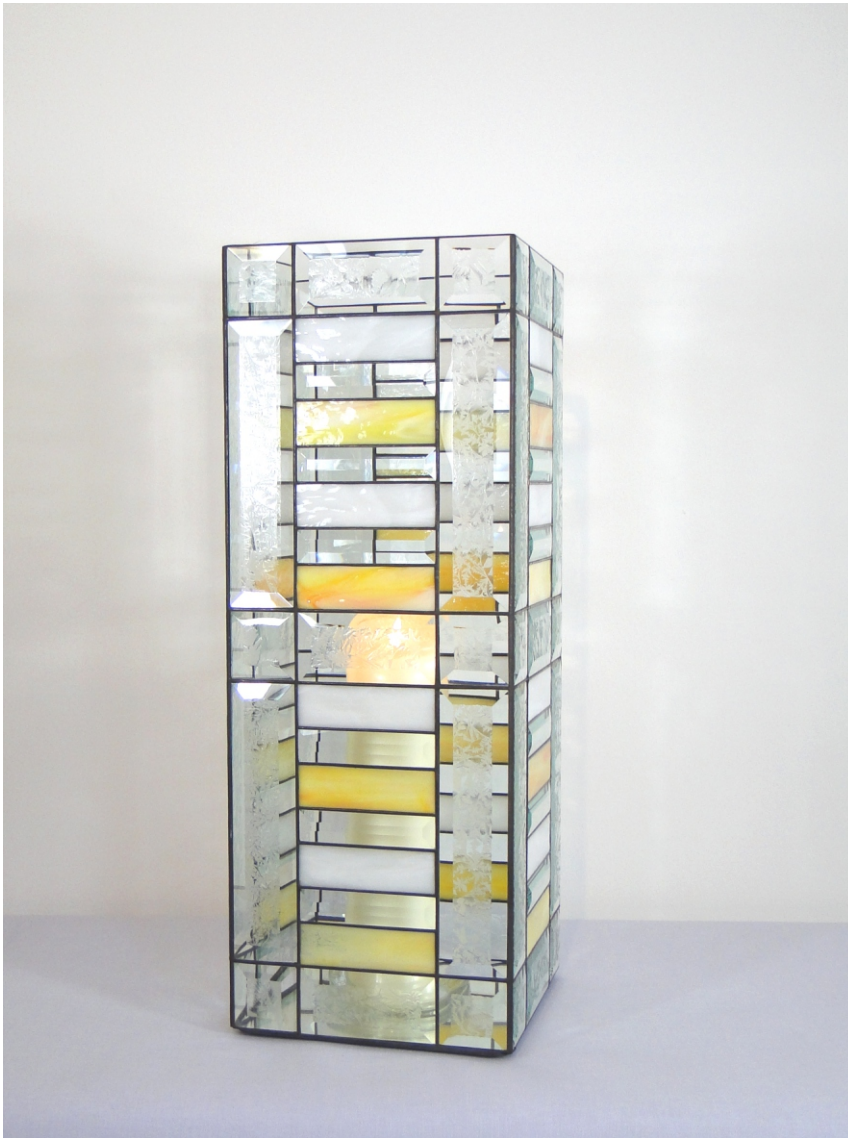
Candle holder "tower frame" approx. 21 x 21 x 52 cm / 8" x 8" x 20"