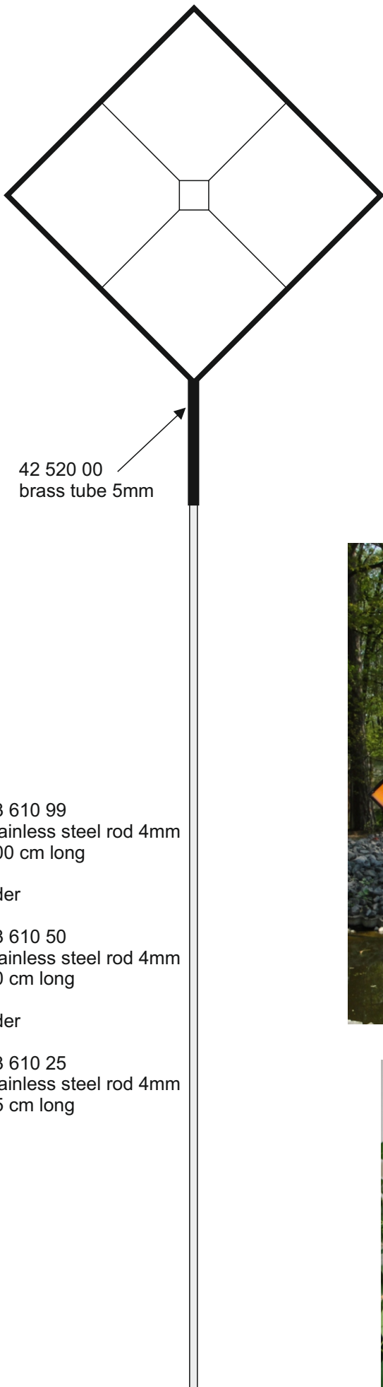
Garden Sticker "diamond"