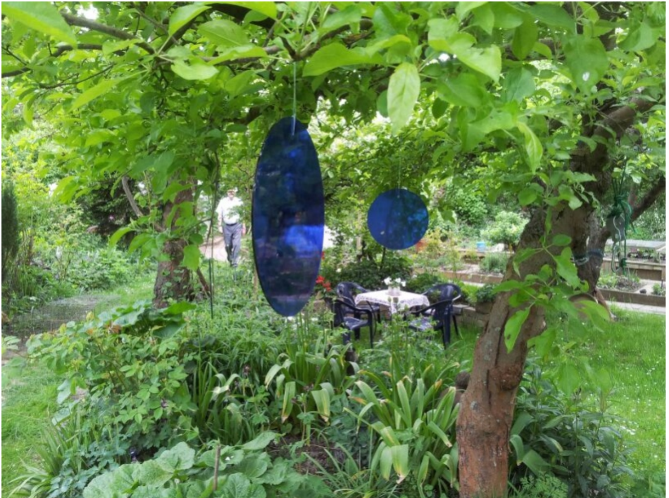
Little effort - great effect! Good mood in the tree and or bush - there, look here ...