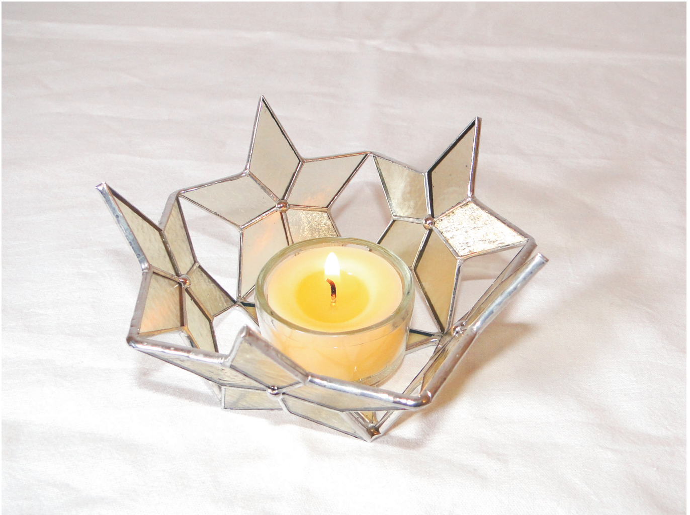
Party Light Candle holder Star Circle Diameter 11,5 cm, Hight 6 cm