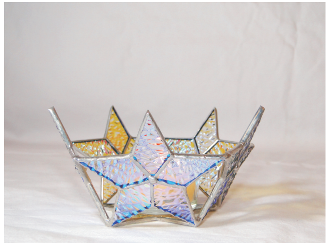
Dichroic Spectrum 100 GG Rainbow ( 3531620 )