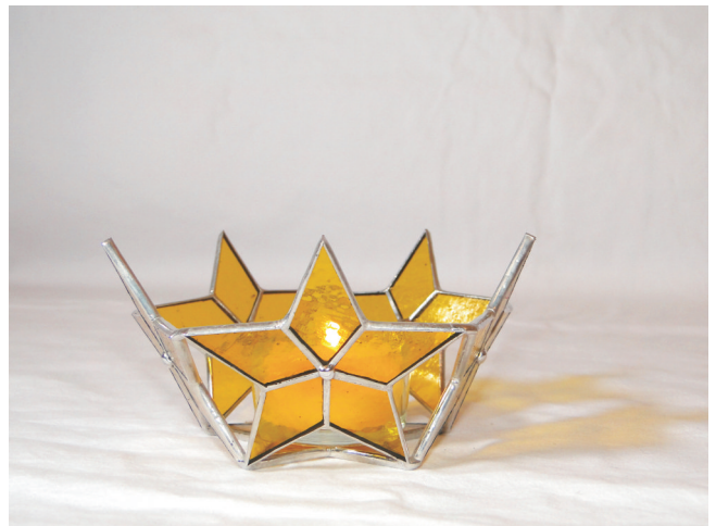
Bullseye 1320-31F warm yellow iridescent