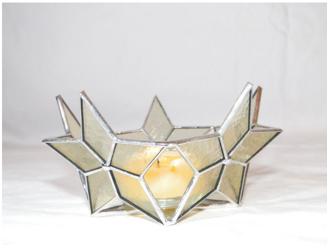
Bullseye 1437-31F pale amber iridescent