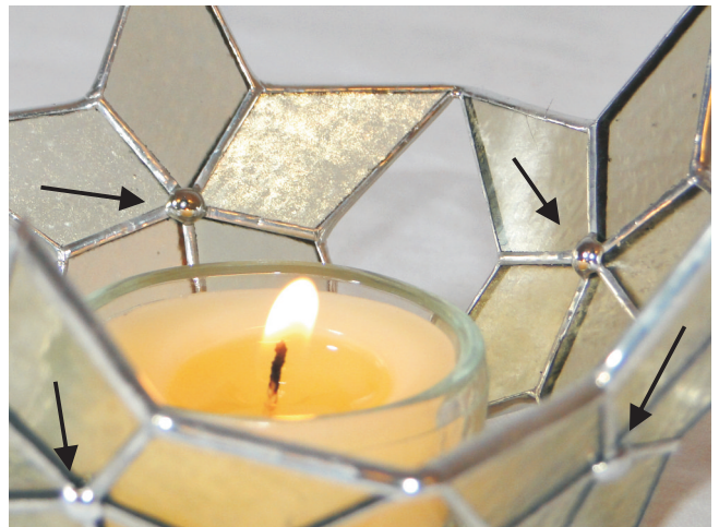
Decorate the center of the stars outside and inside with a small drop of solder.