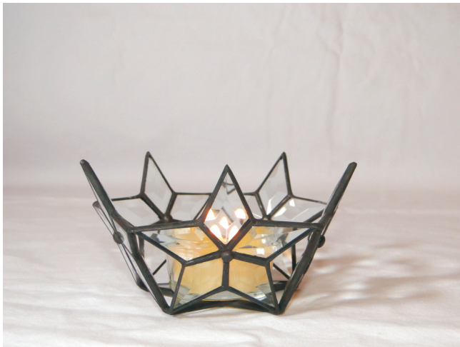
star bevels from bevel set 8561001