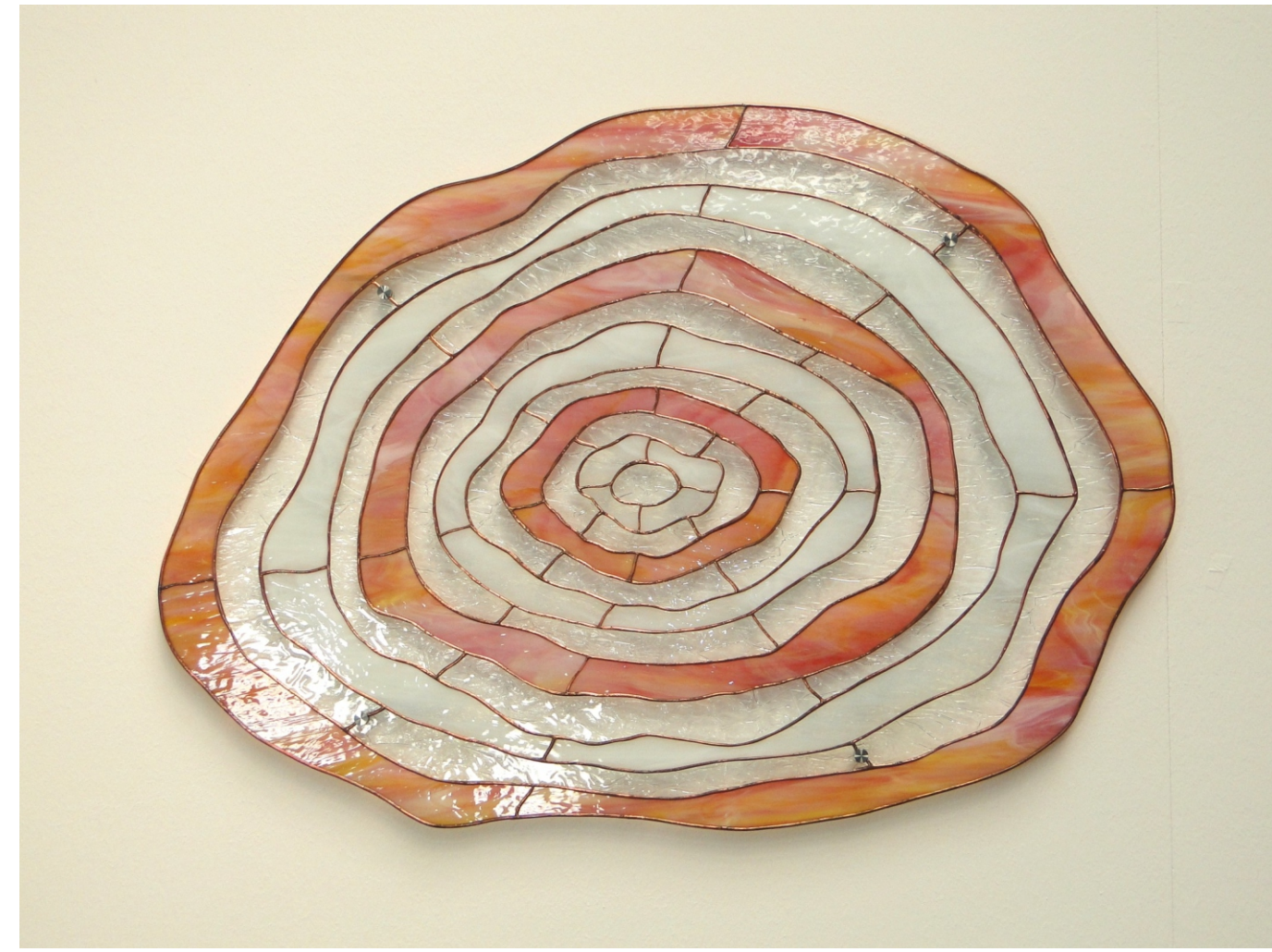
Room design "Growth Rings" ca. 101 x 72 cm / 28" x 40"

Glass selection: Ring 1, 3, 5, 7, 9, 11 : Spectrum 100 K Ring 2, 6, 10 : Spectrum 6000-81 CC Ring 4, 8, 12 : Spectrum 6092-83 CC