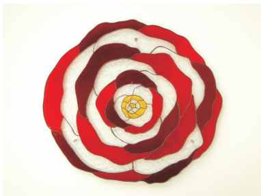
Room design "Rose Flower"