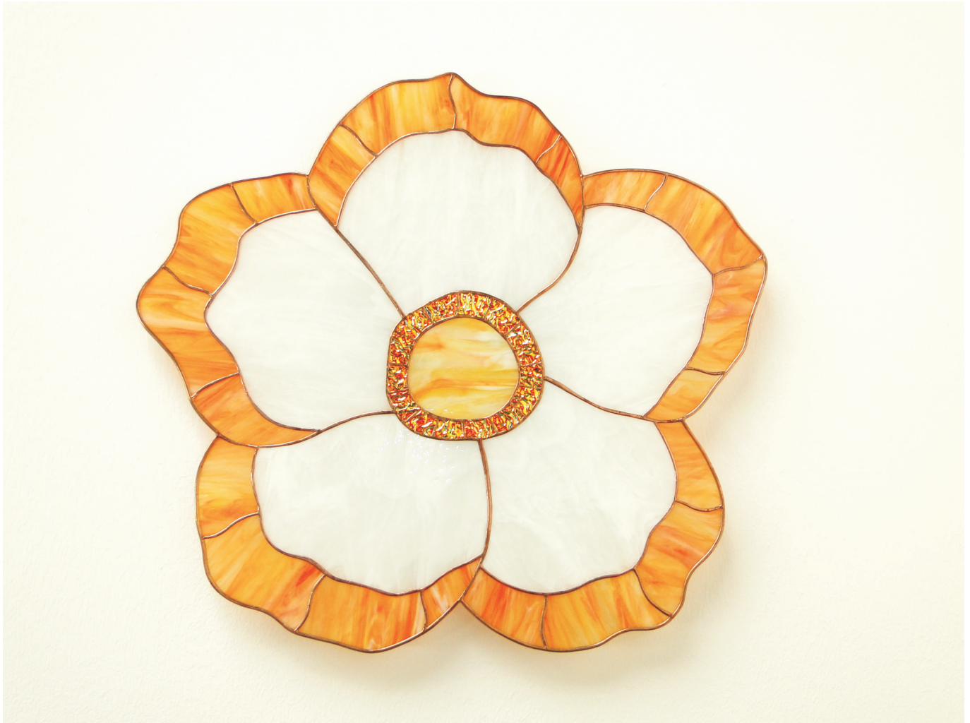
Room design "Flora" original size approx. 65 x 60 cm ( 26" x 24" )