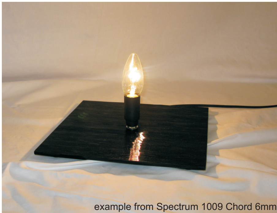
The light base 25 x 25 cm

The size of the light base is 25 x 25 cm, with a 12mm drilled hole in it's middle.