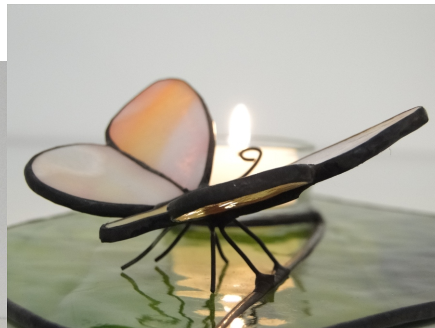
leaf approx. 25 x 15 cm ( 10 x 6" )