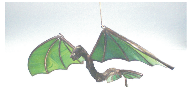
Solder the glass pieces at a slight angle, the result is a three dimensional effect.