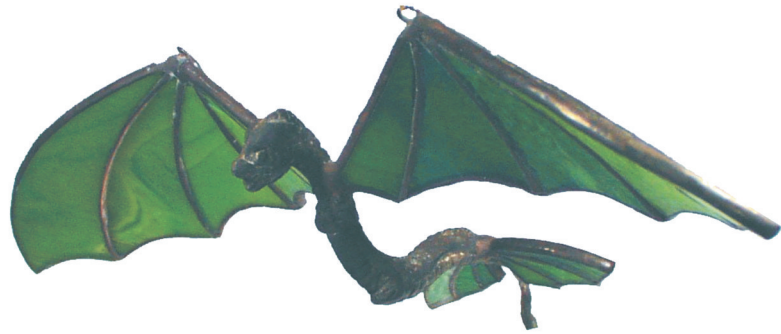
27 907 00 tin figure Dragon