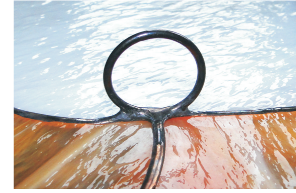
Room design " Daisy " Original size approx. 60 cm / 24"

Spacers made of 2mm brass wire. Prepare two rings and solder them at the back of the image down at the rear panel. These spacers ensure that the picture will hang perpendicular to the wall. (You will have the same distance everywhere, on the wall)