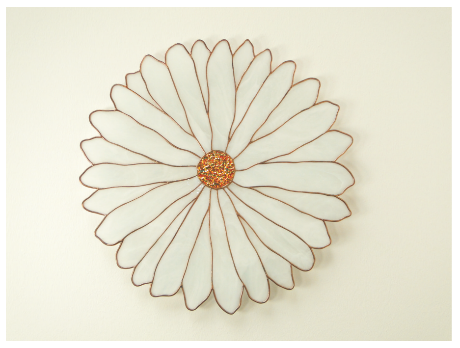
Room design " Daisy "