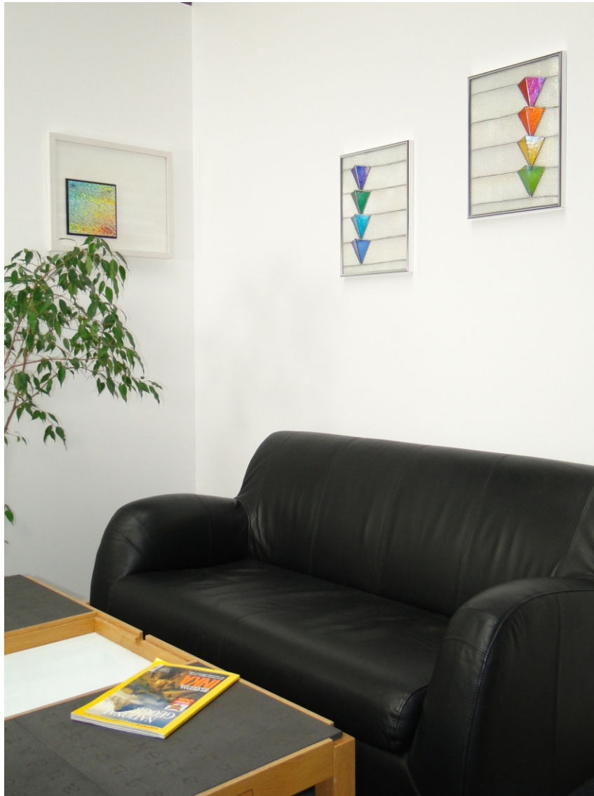
"Kite" original size approx. 30 x 40 cm ( 12" x 16" )