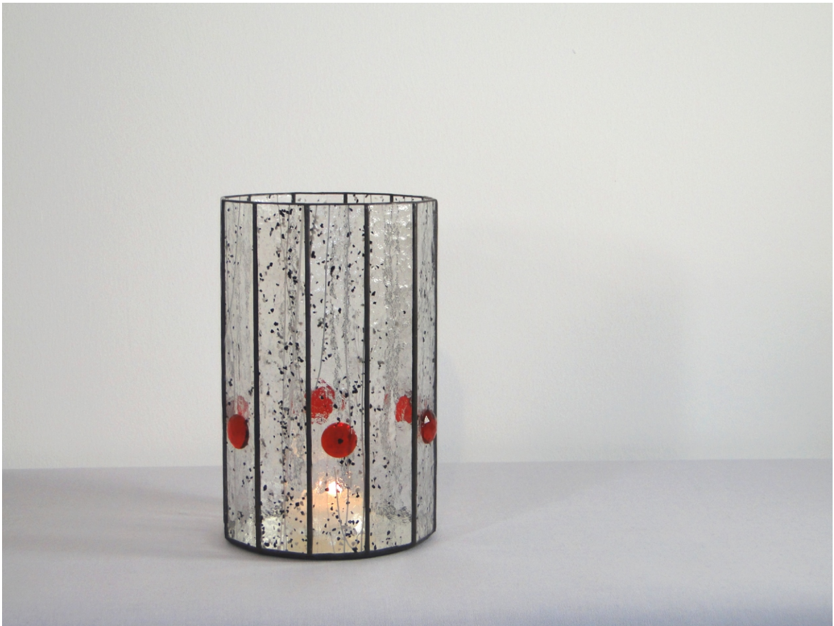
Candle holder " glass jewels " approx. 16 x 25 cm / 6" x 10"