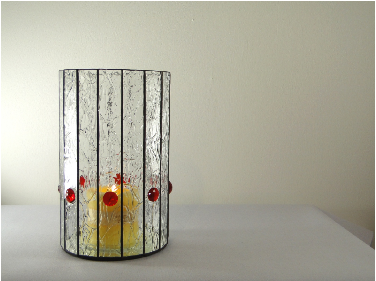
Candle holder " glass jewels " approx. 15 x 25 cm / 6" x 10"