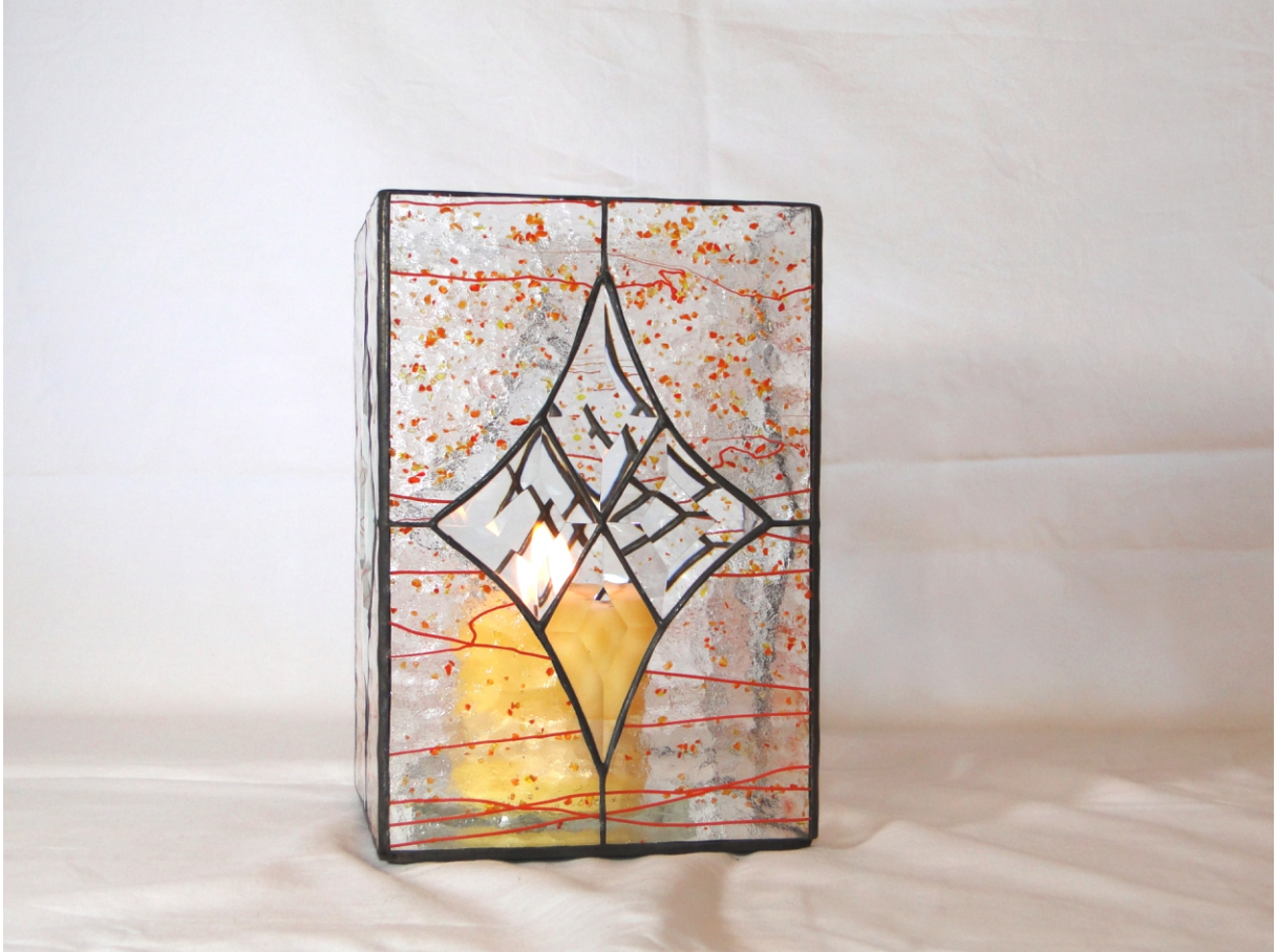
Candle holder "ornament" approx. 15 x 23 cm / 6" x 9"