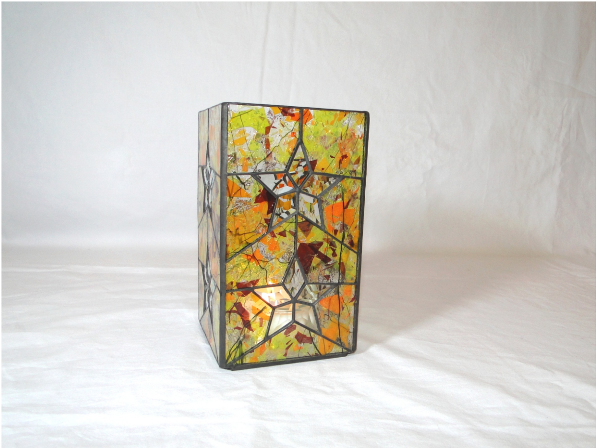
Candle holder " star light " approx. 10 x 10 x 20 cm / 4" x 4" x 8"