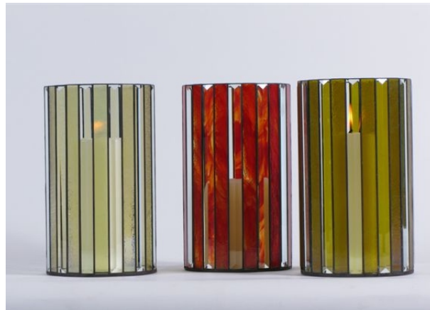
candle holder no. 1