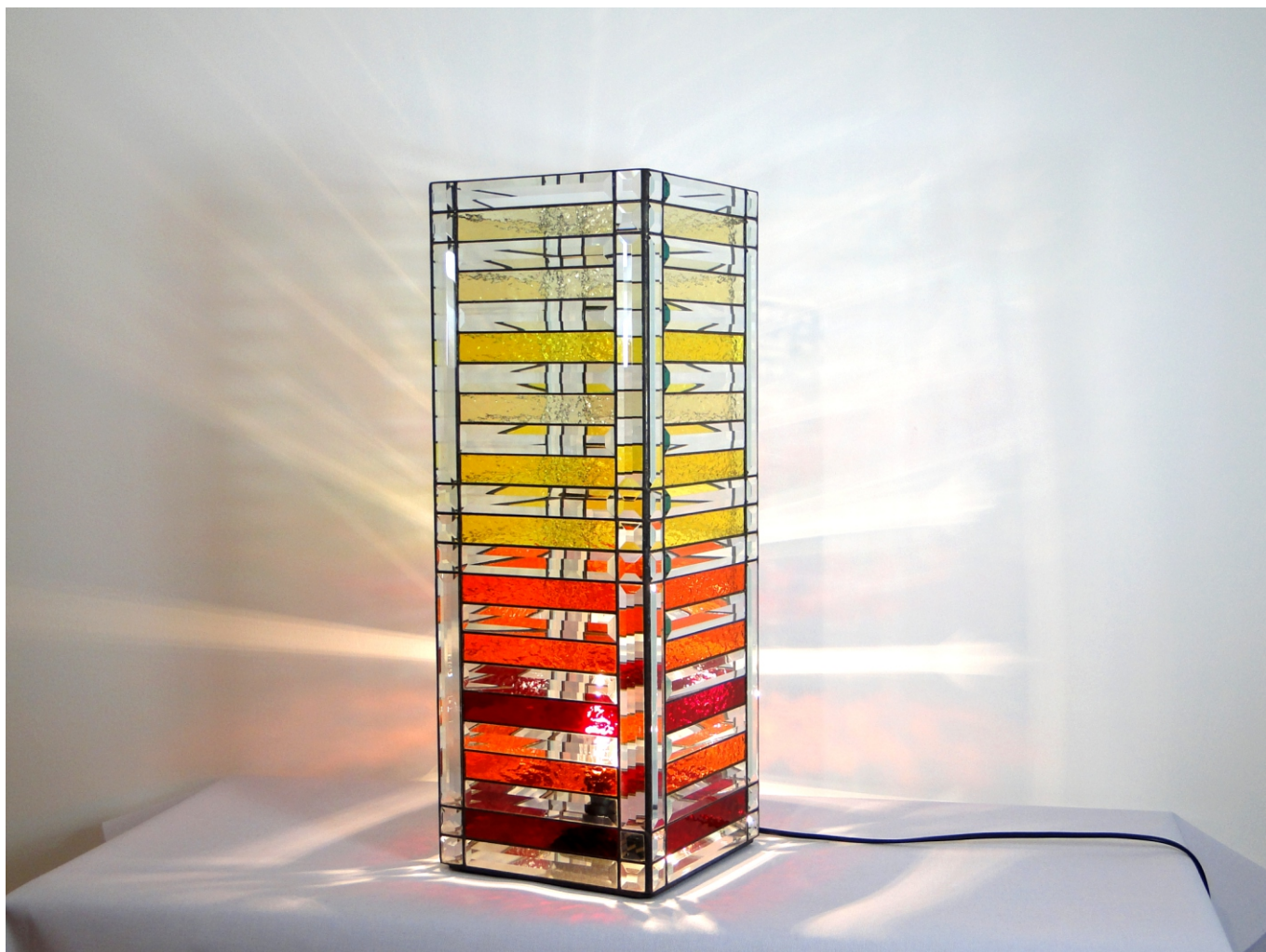
Candle holder "tower 1"