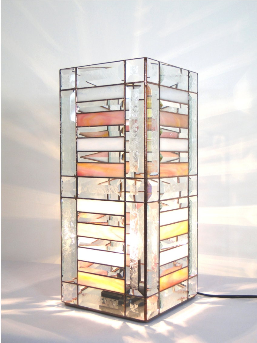
Candle holder "tower frame" approx. 18 x 18 x 42 cm / 9" x 9" x 17"