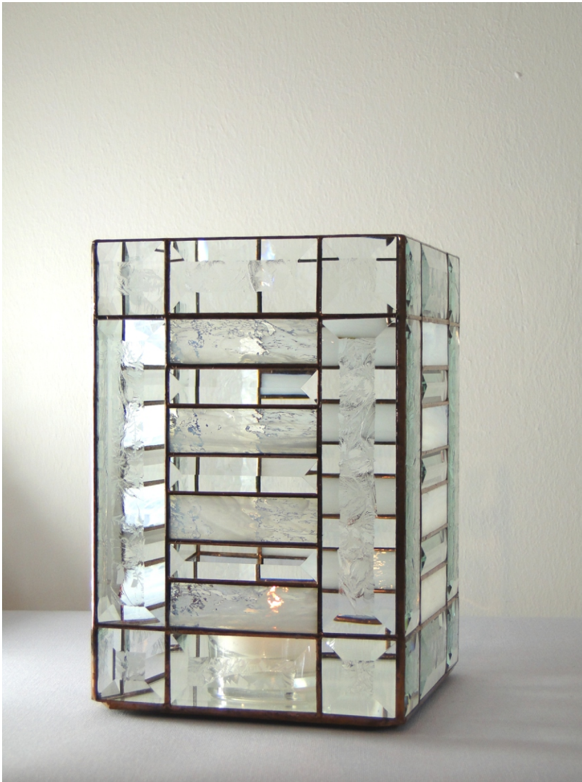
Candle holder " tower frame " approx. 15 x 15 x 23 cm / 6" x 6" x 9"