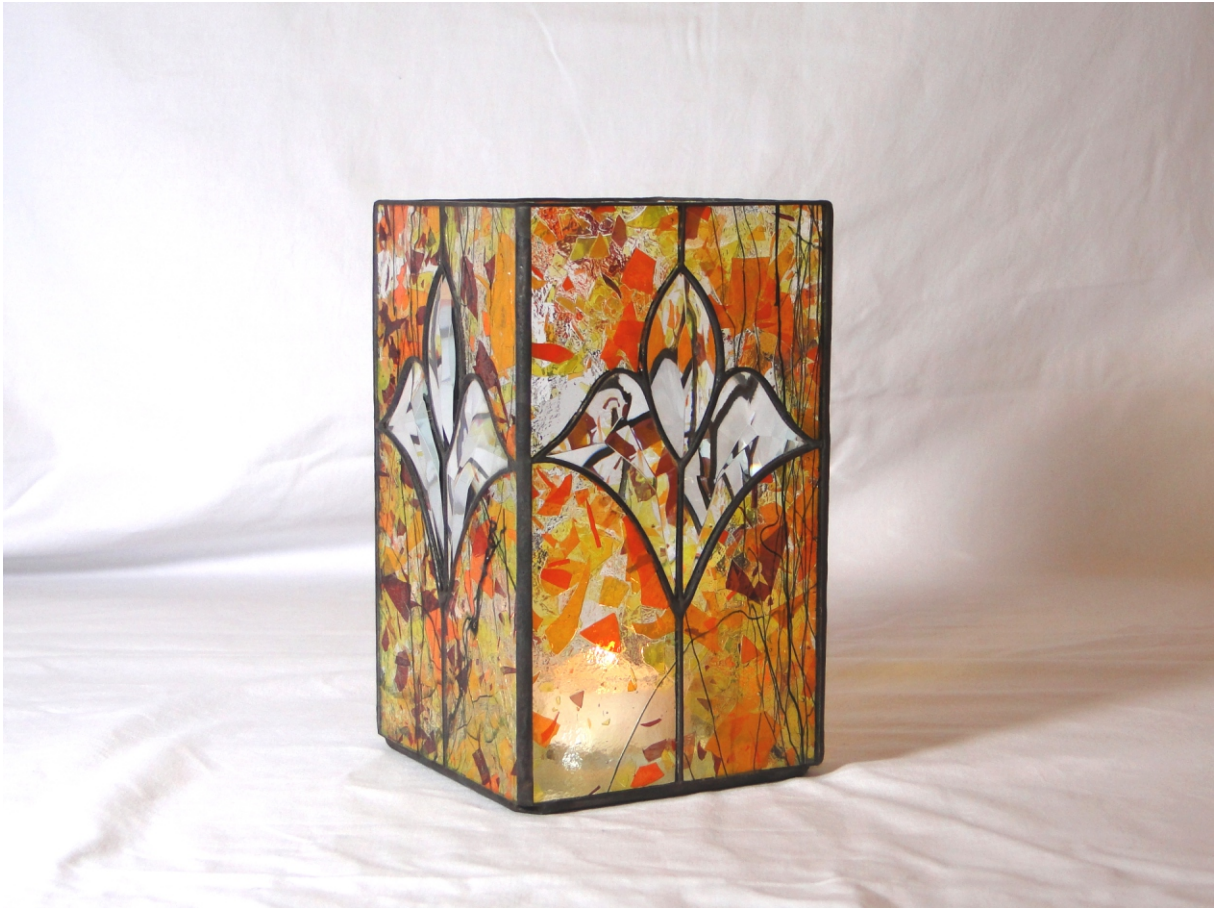
Candle holder "tulip" approx. 12 x 21 cm / 5" x 8"