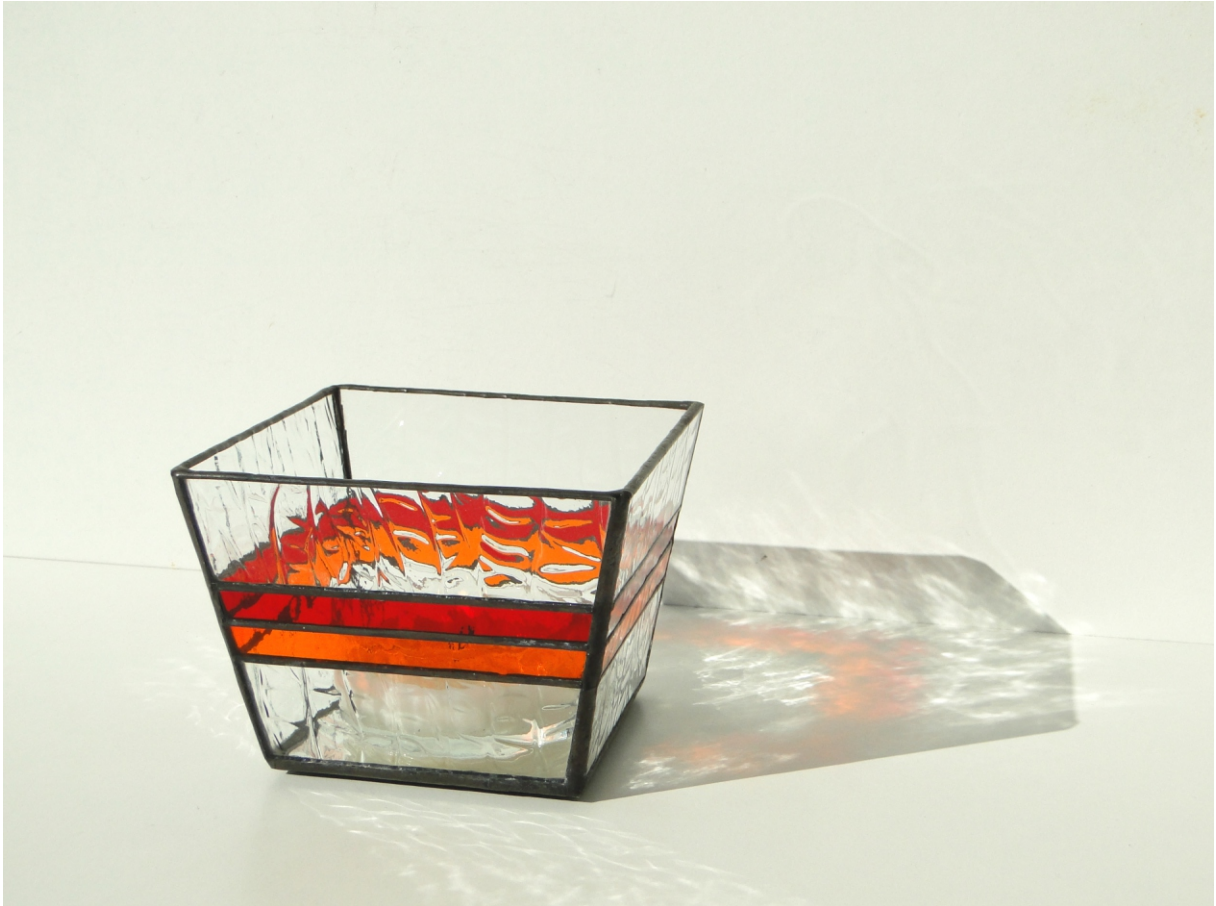
CandleLite "Alice" approx. 11 x 11 x 9 cm ( 4,5 x 4,5 x 3,5" )