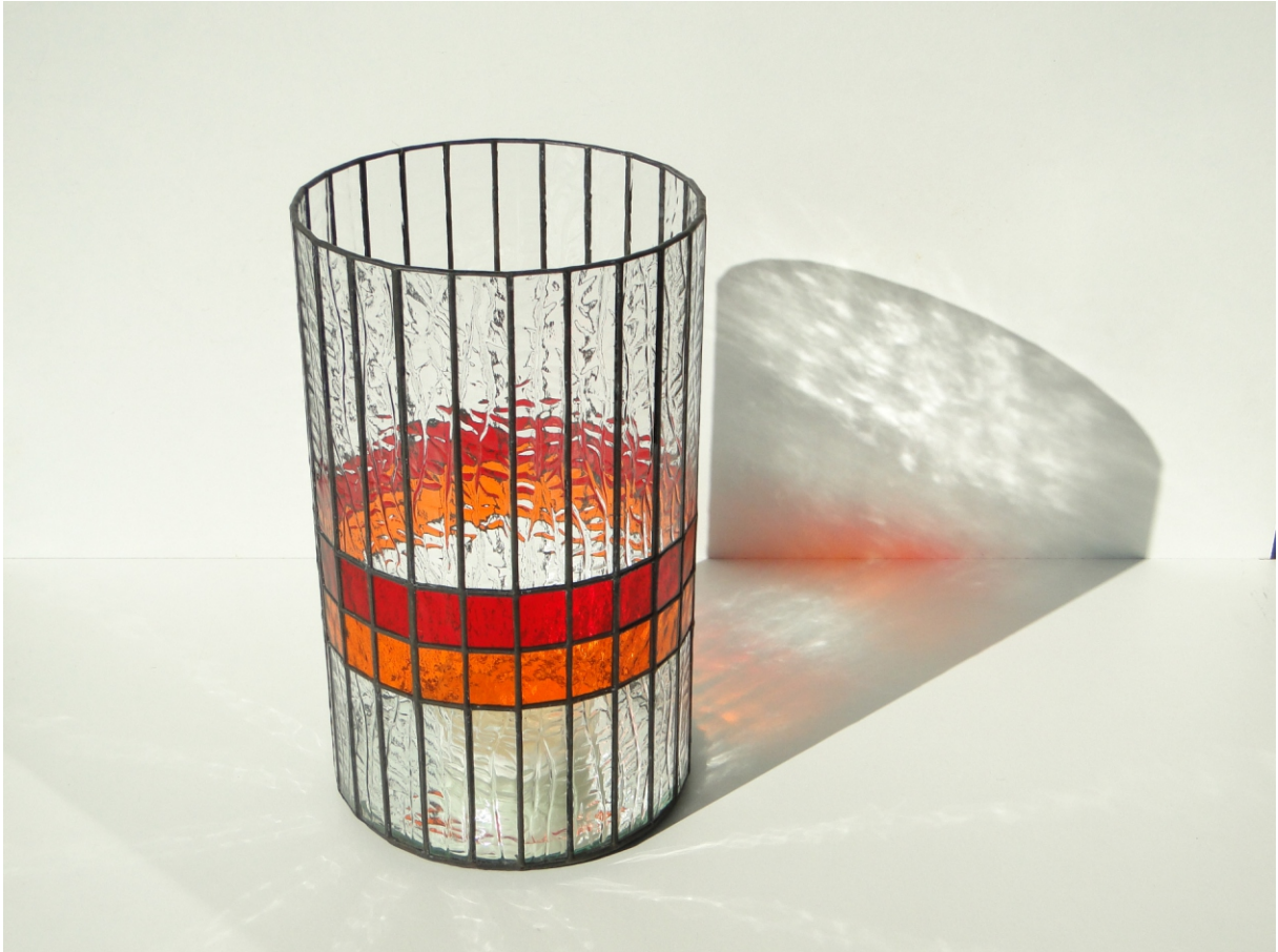
CandleLite “Cala” approx. 15 x 25 cm ( 6 x 10" )