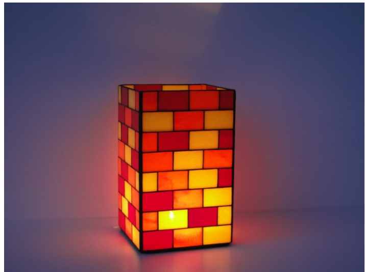
The vase is also suitable as candle holder

Only if you use the vase as candle holder or for synthetic flowers: If you cut the corners at the mirror, you produce small air holes in the bottom and later the candle burns better.