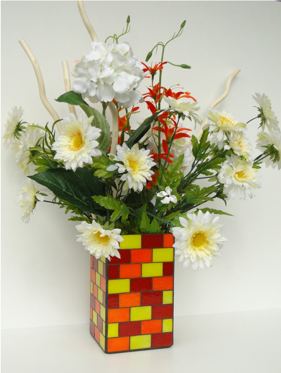
Flower vase " Bricks "

size approx. 12 x 12 x 20 cm / 5 x 5 x 8"