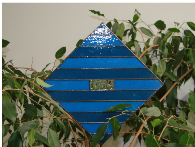
....Design in a small space...