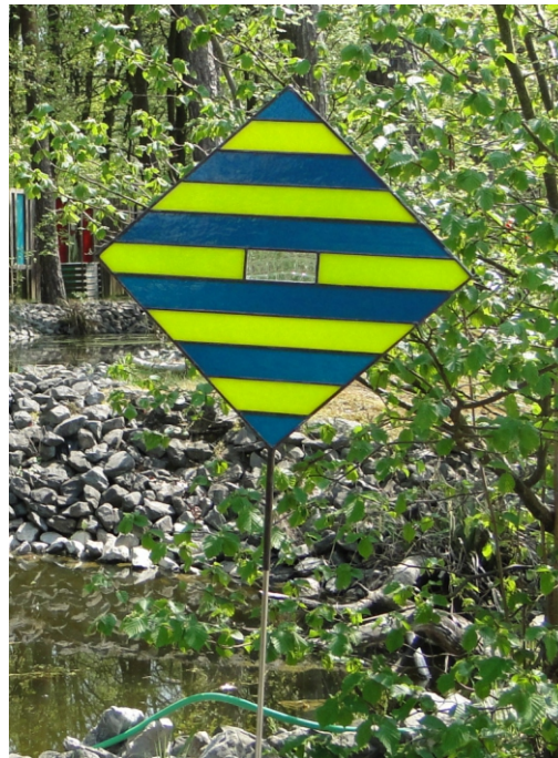
Precious designed glass in the garden