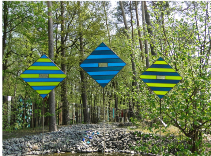
Garden Stick " Zebra "

13 610 25 stainless steel rod 4mm 25 cm long