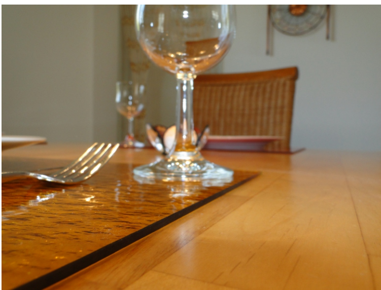
...with seamed edge