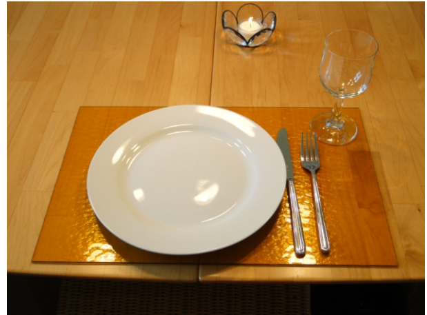
Spectrum 161RR, size: 29 cm x 45 cm, approx. 12" x 18"