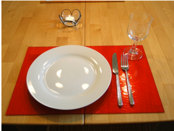
Spectrum 171RR, size: 29 cm x 45 cm, approx. 12" x 18"