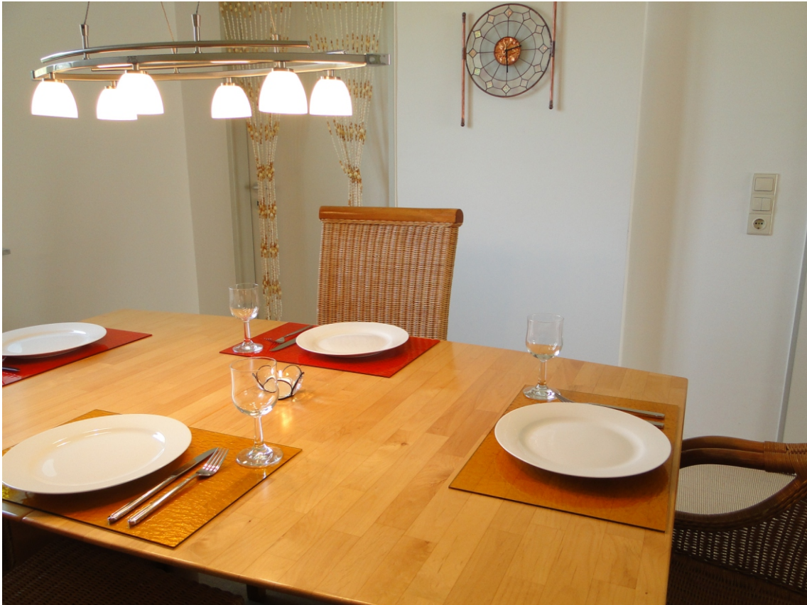
placemats made from glass..