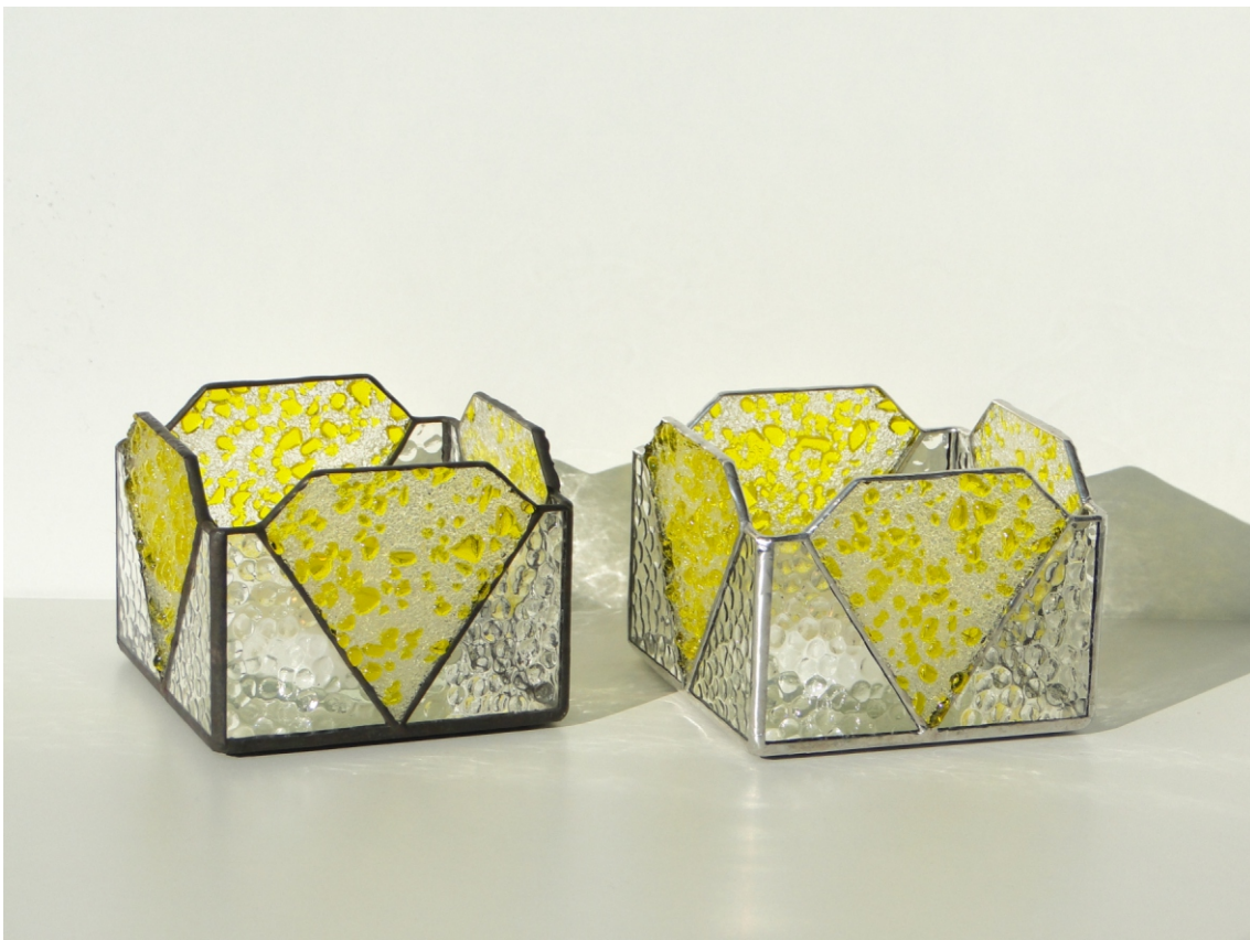
Here the unpatinated and the black patinated version in direct comparison.