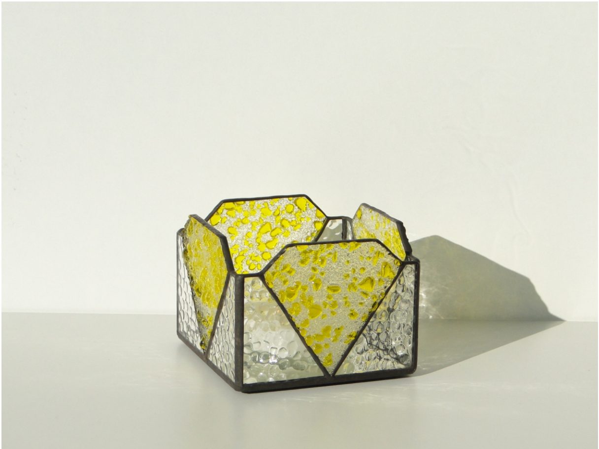
Votive "Diamond" approx. 10 x 10 cm ( 4" x 4" )