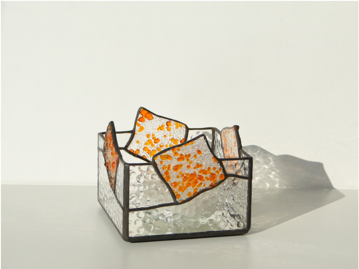
Votive " Field " approx. 10 x 10 cm ( 4" x 4" )