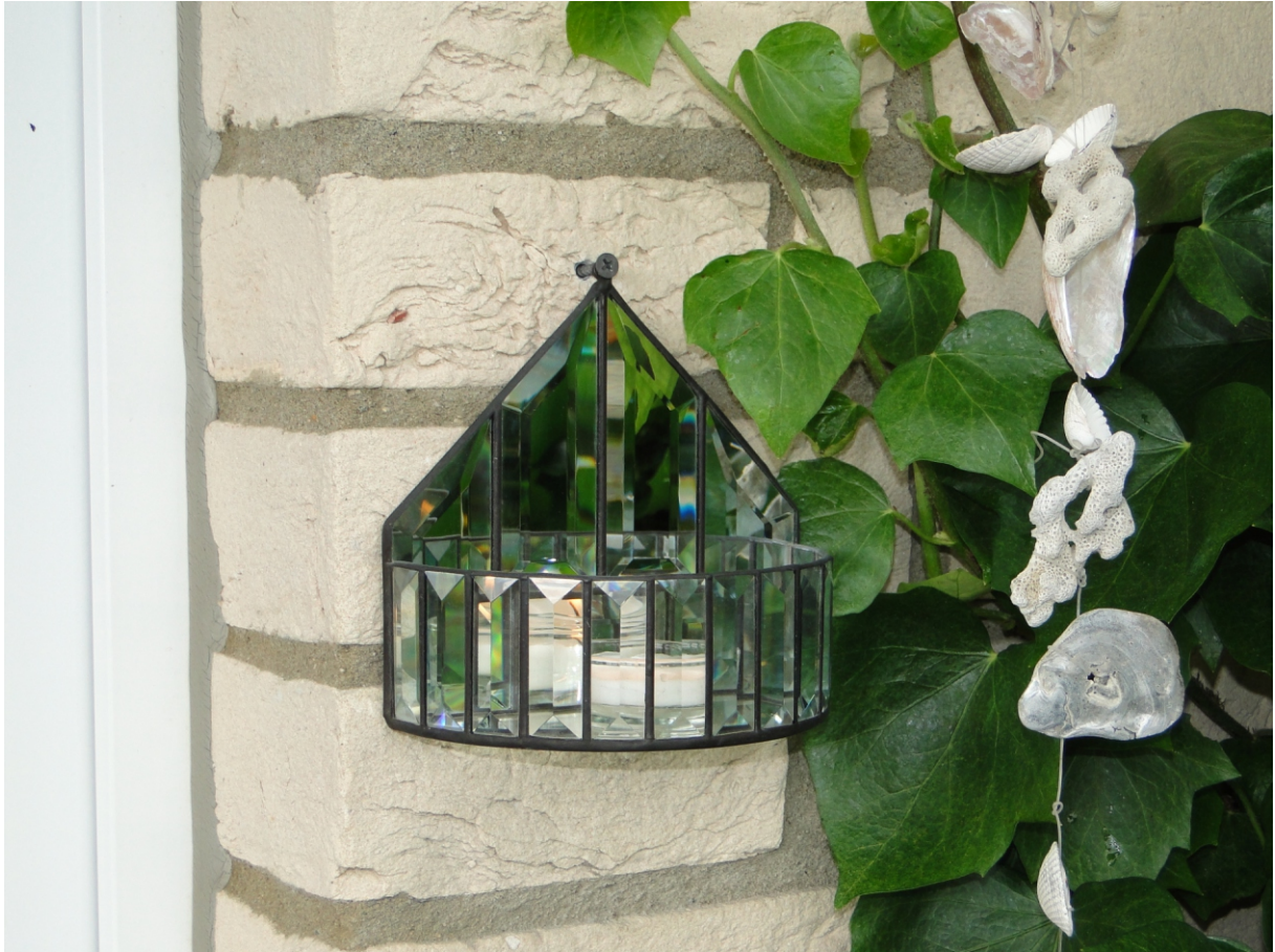
Wall candle holder Multifaceted