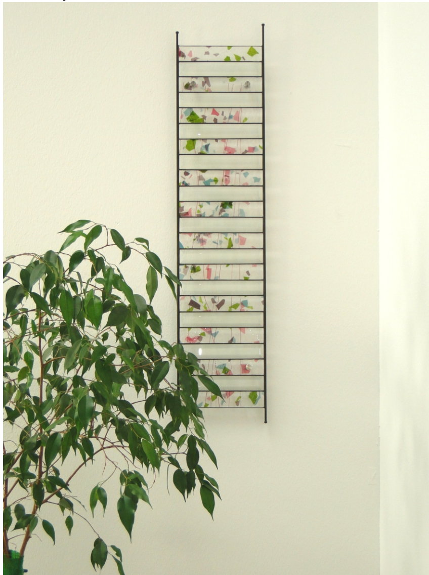
“ Bevel Lines “

original size approx. 21 x 100 cm / 8" x 40"