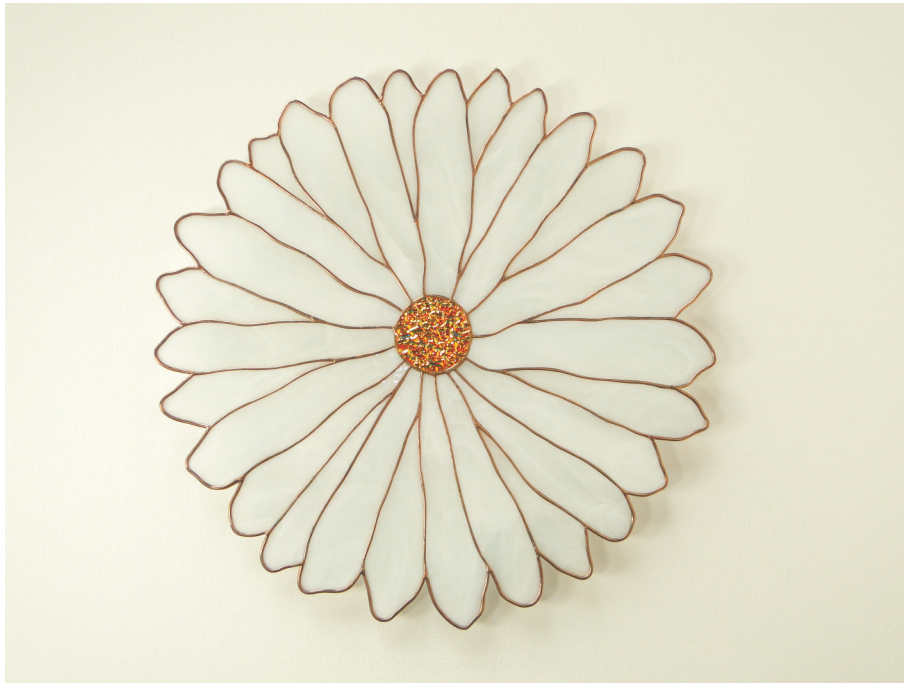
Room design " Daisy "