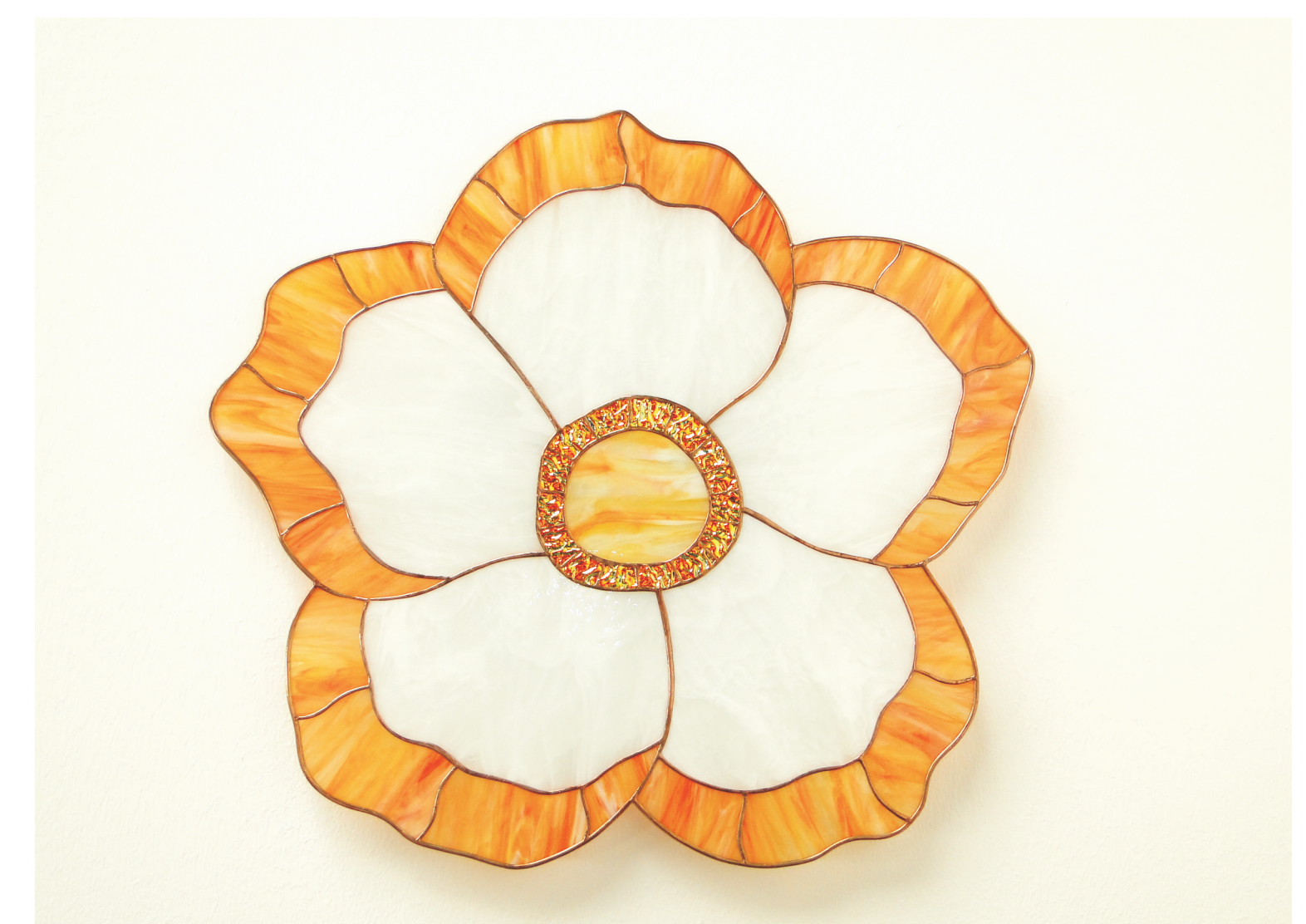
Room design "Flora"