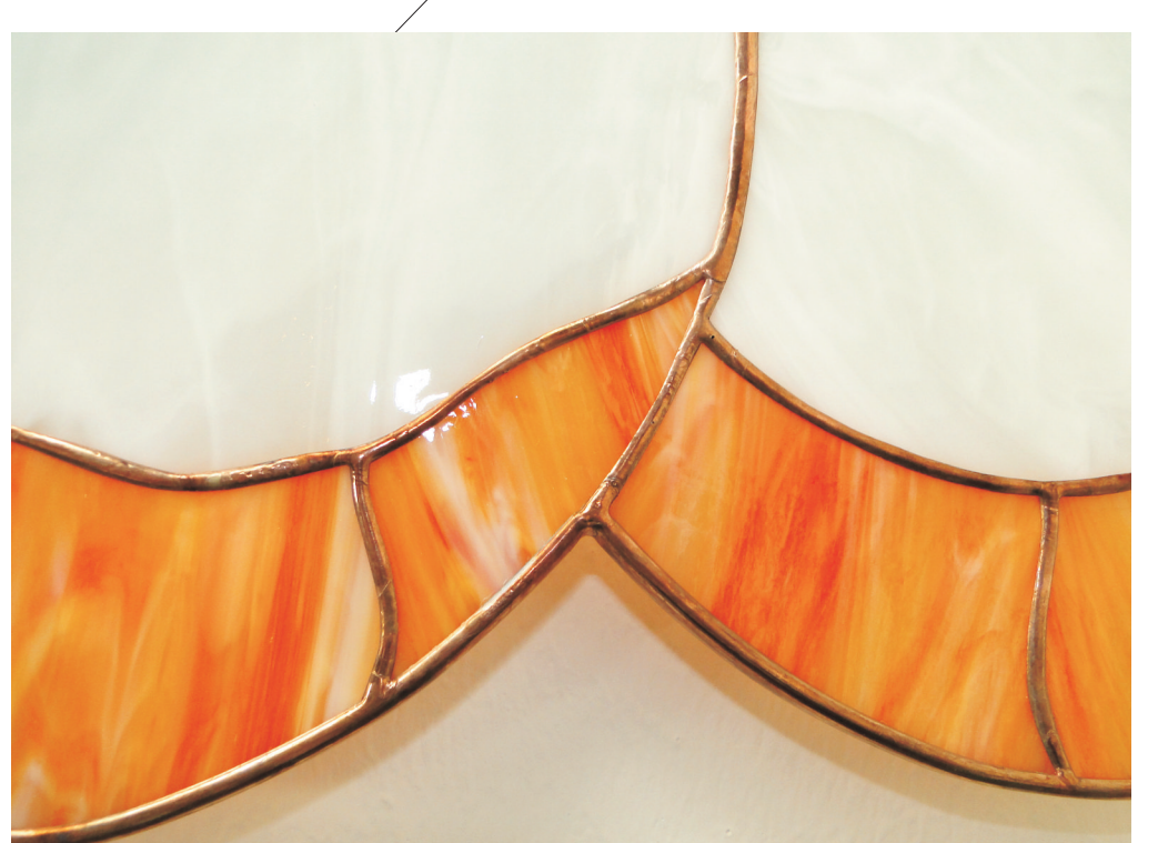
Lead came U shaped 4x4mm (4214801) When you coat the lead profile with solder, you can also use coppercolor to patinate it.

Glue the lead profile along the shape of the whole glass object, for permanent holding.