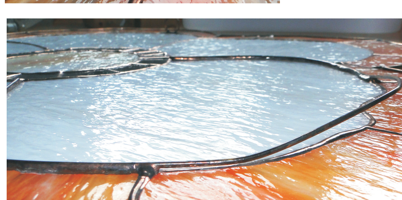
Suspension from 2mm brass tube soldered to the back.