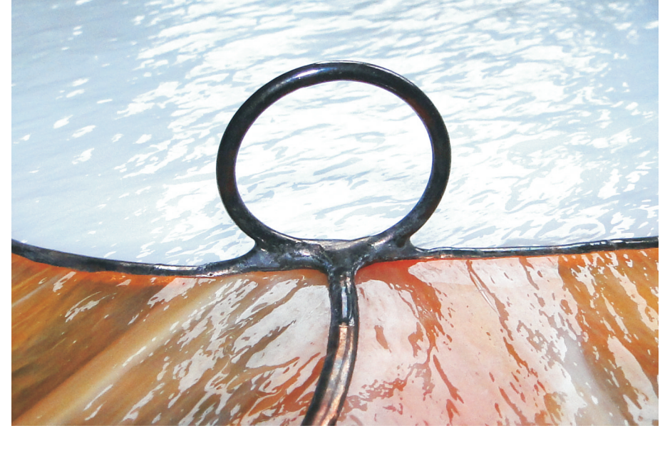
Spacers made of 2mm brass wire. Prepare two rings and solder them at the back of the image down at the rear panel. These spacers ensure that the picture will hang perpendicular to the wall. (You will have the same distance everywhere, on the wall)